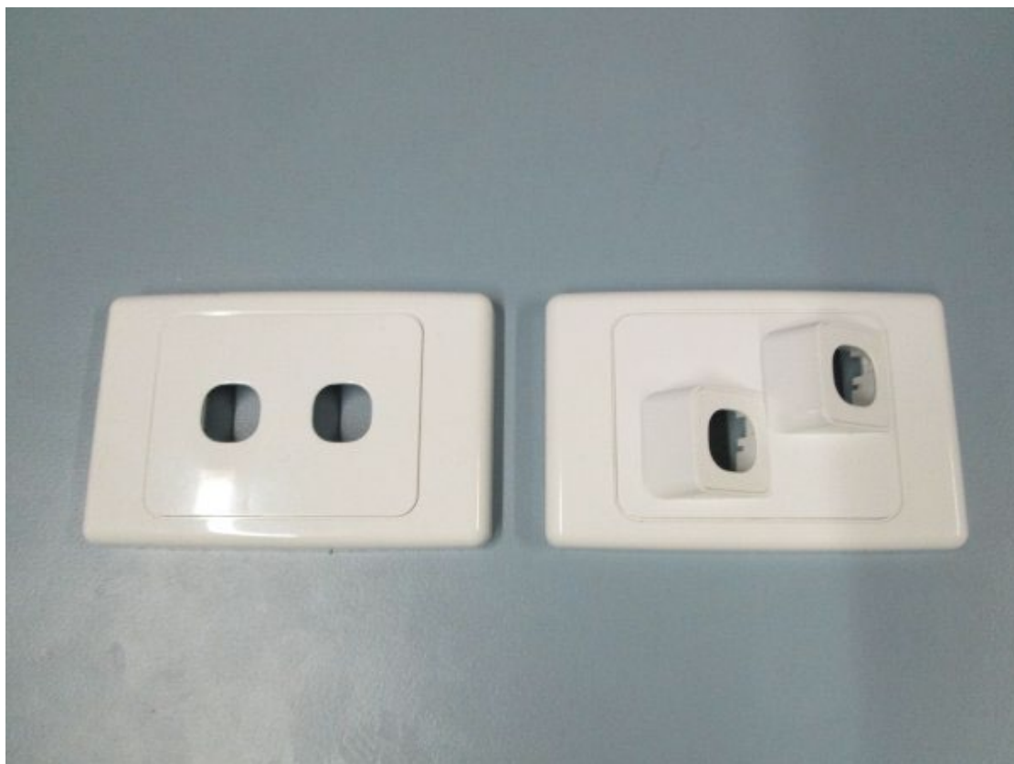
Figure 8-1: Faceplates for telecommunications outlets

Quad plates are not allowed because there isn't enough room on them to fit our required labelling. Only use singles, duals and triples.